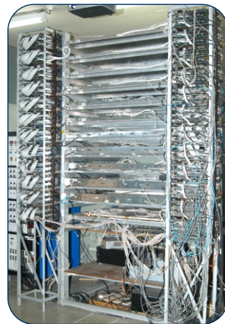
Prototype detector at TIFR.